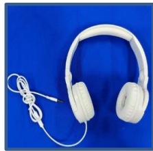
Image de l'article. Sample picture of the item.

L'objet décrit est conforme à la législation d'harmonisation de l'Union pertinente: The described object of the declaration is in conformity with the relevant Union harmonisation legislation: