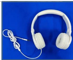
Foto del prodotto Picture of the item

L'oggetto descritto è conforme alla pertinente normativa di armonizzazione dell'Unione: